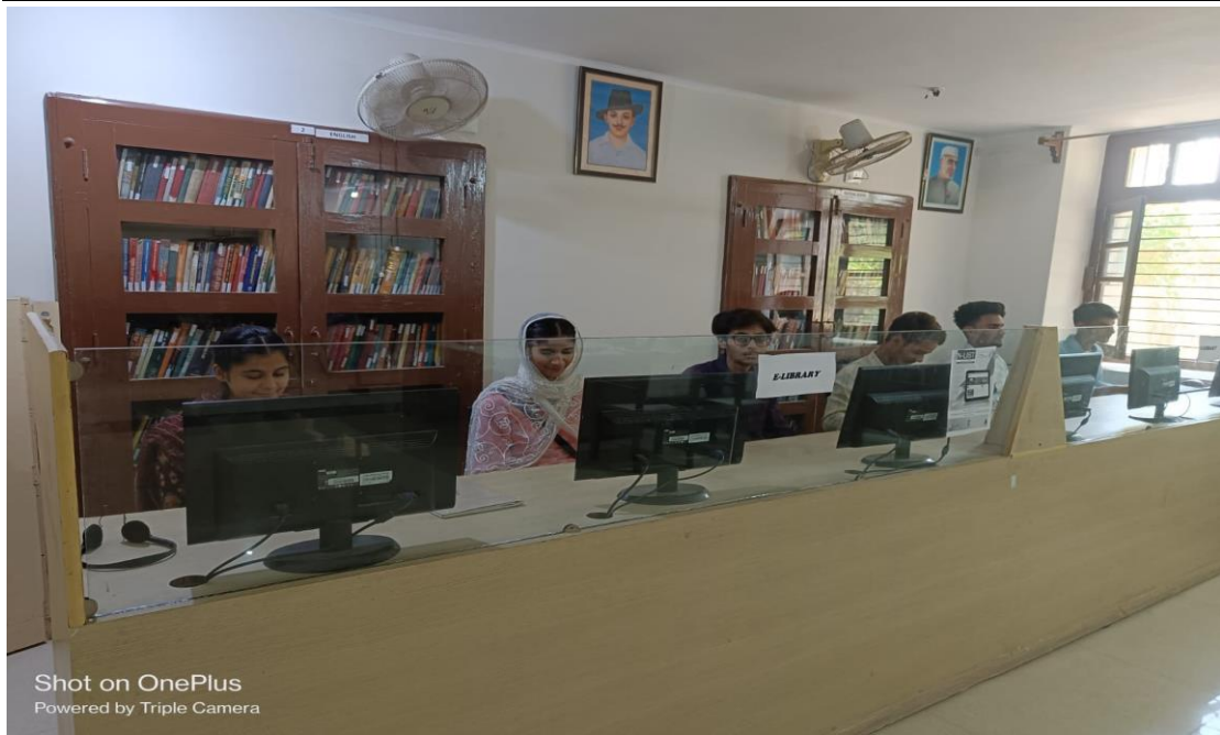
Shot on OnePlus Powered by Triple Camera

Principal Guru Nanak College Killianwali (Sri Muktsar Sahib)