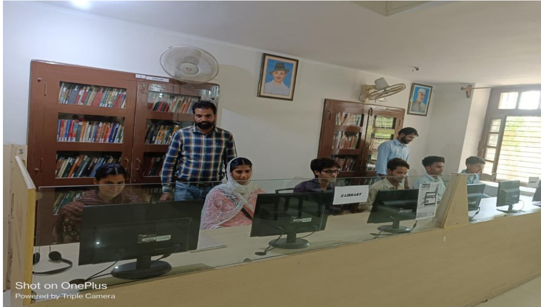
Shot on OnePlus Powered by Triple Camera