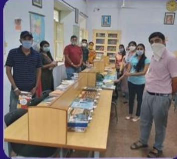
Book-Bank Facility for needy students