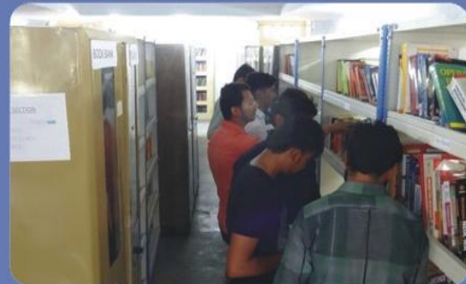
Open Shelf System